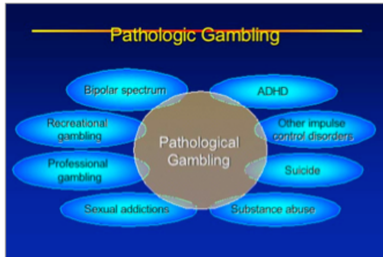
Fig. (3). Pathologic Gambling

Pathologic gambling has traits in common with many different psychiatric disorders.